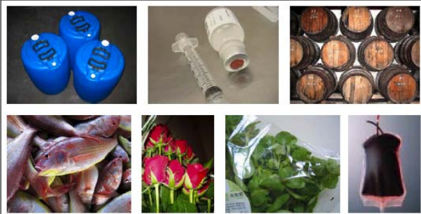
Perishables each have a unique shelf life

Perishables each have a unique spoilage rate (shelf life). Perishable producers know this and use shelf life to determine the expiration date on perishables.